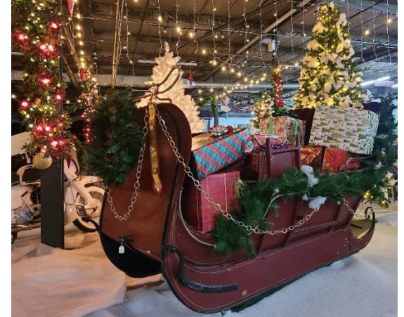
1800's Canadian-Russian Sleigh